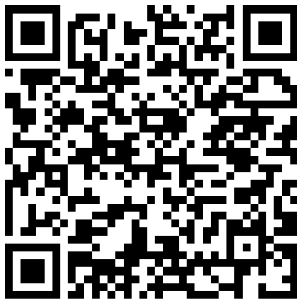
Give Lively Donation Page

Shop Amazon? Sign up or include The Terrace Foundation - When you shop on Amazon Smile, Amazon donates 5% of your eligible purchases to our nonprofit at no cost to you.