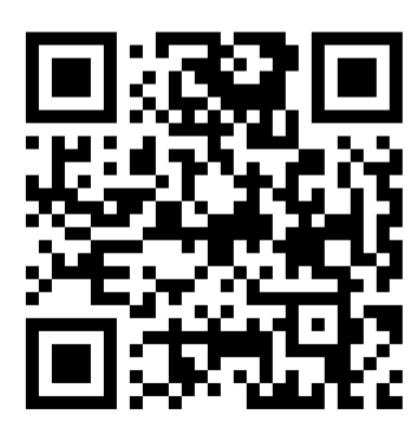
Amazon Smile QR Code