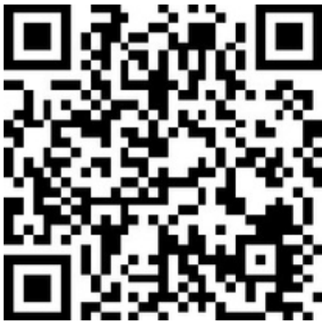
Paypal QR Code

By using our Amazon Smile link, Amazon will donate .5% of eligible purchases to us with no extra cost or fees.