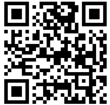
Amazon Smile QR Code